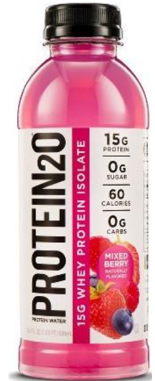
Low-fat / low-calorie